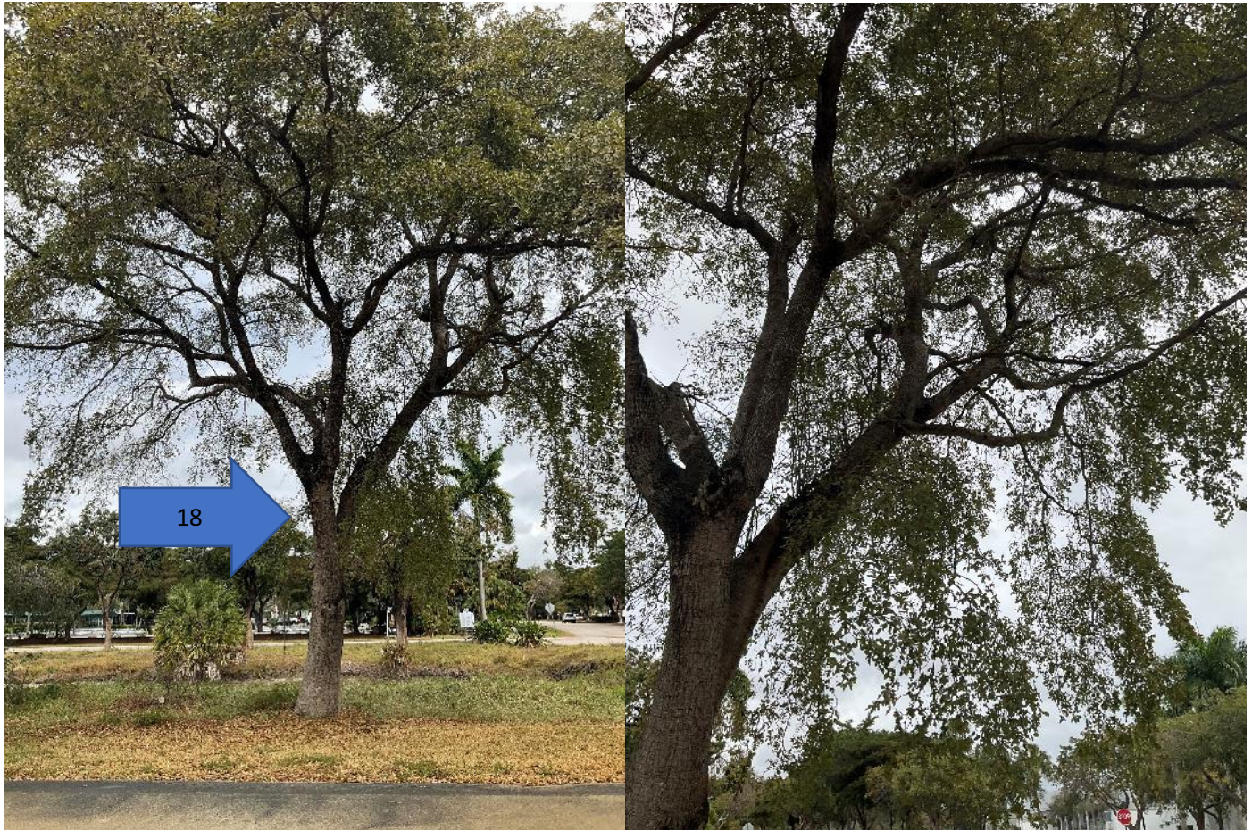
Black Olive ( Bucida buceras ), facing north. Note poor structure, canopy dieback, deadwood, visual evidence of decay, and water sprouts.

Jeremy T Chancey, Registered Consulting Arborist 1323 Southeast 17th Street, #201 Fort Lauderdale, Florida 33316 c 954 612 2500 jeremytchancey@gmail.com