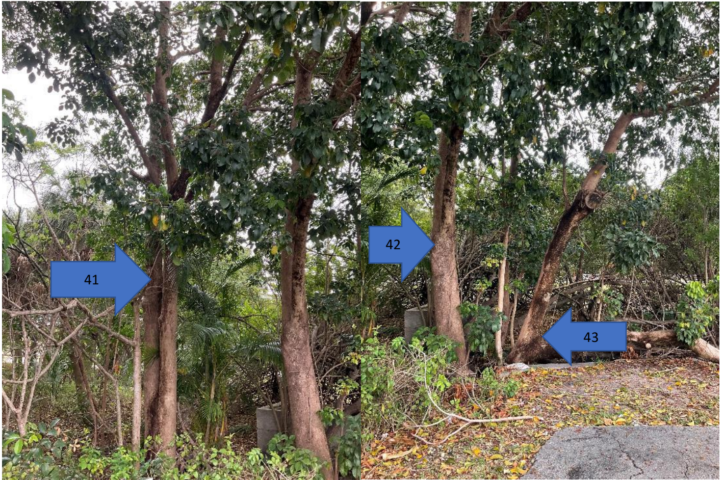
Bishopwood trees ( Bischofia javanica ), facing north. Note all trees are Florida Invasive Species Council Category I Invasives.